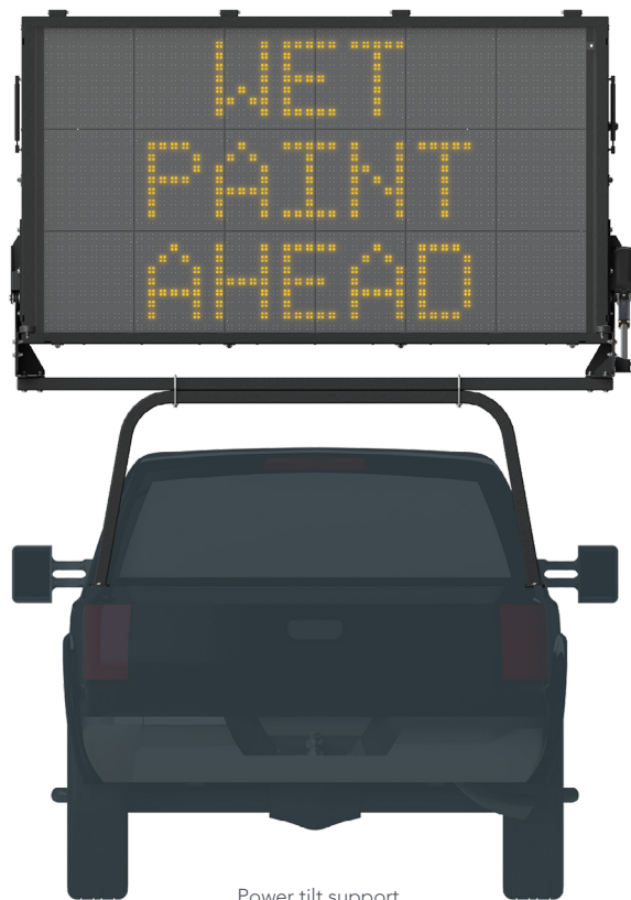
Power tilt support