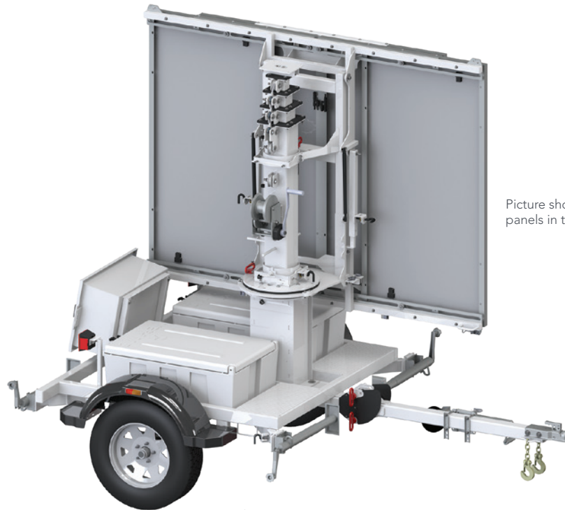
Picture showing 900 watt solar panels in transport mode