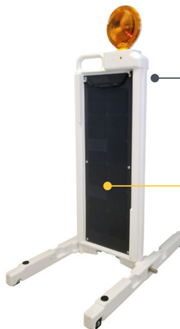
AUTONOMOUS DEVICE NCHRP 350 CRASH TESTED

Ver-Mac's Speed-Mac VP is a patent-pending design that combines the Speed-Mac 2.0 with vertical solar panel. It can be easily set up by one man and will operate all season without recharging in most applications. The Speed-Mac VP is the only autonomous NCHRP 350 tested and approved device on the market.